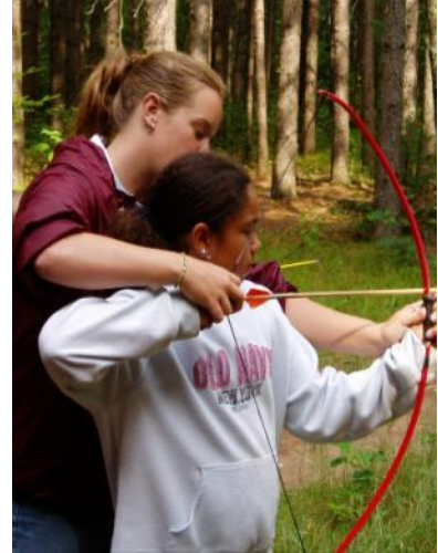
Still the most requested sport