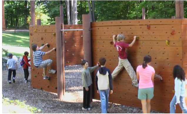
Bouldering Wall (requires no spotters or ropes)