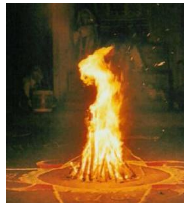
Two of the classic rituals of camp are still important today for creating a sense of belonging: Singing graces at meals, and singing around the campfire.