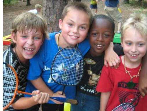
Even badminton is still popular with kids.