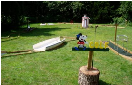
Camper-built “Mini” Golf (get it?)