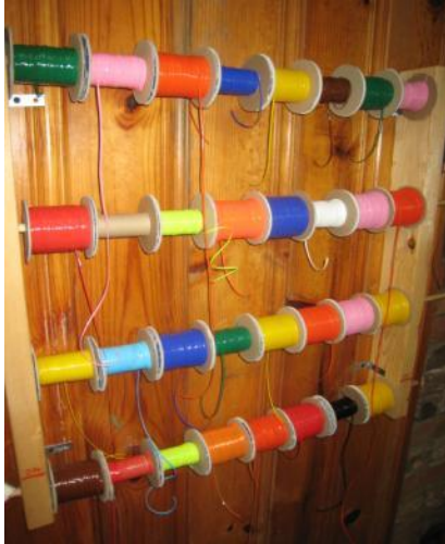
Remember "Lanyard" or "Gymp"?