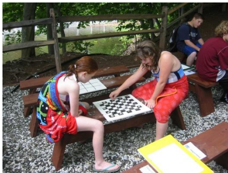
Checkers (“Ooh! You can use black rocks, I’ll use white!”)