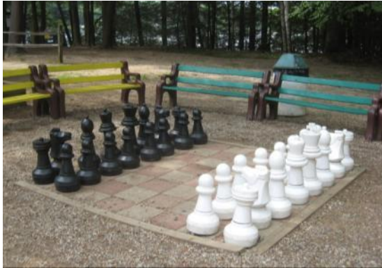
Nerds flock to it; jocks are fascinated to learn.