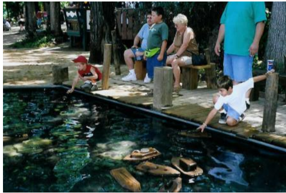
Boatmaking (sailed in a shallow plastic-lined pond).