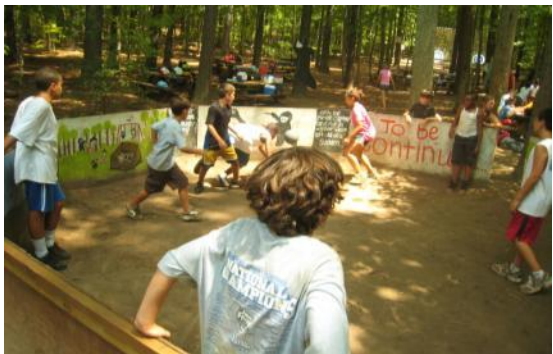
THE most popular new game: GaGa (Israeli Dodgeball)