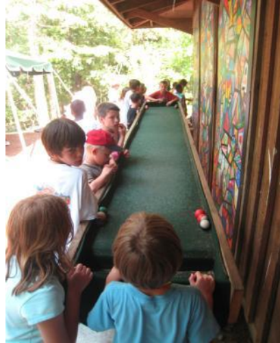
"Carpetball" is hugely popular, (like shuffleboard on a 16' pool table)